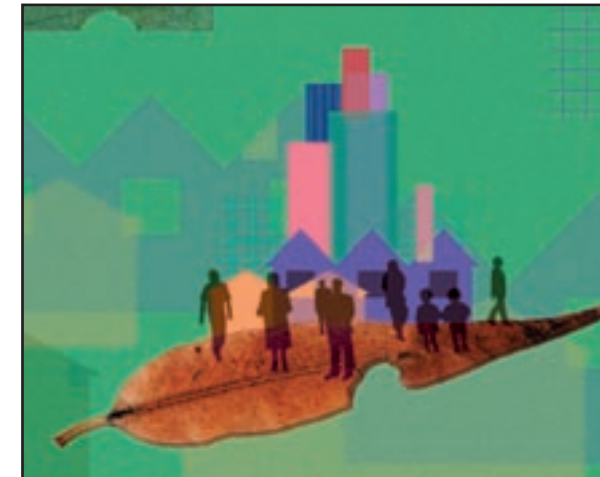
Assessment process and decision making